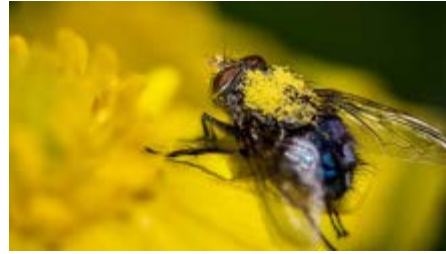
Bats, Beetles, Butterflies... And Other Pollinators That Aren't Bees (and How to Attract Them)