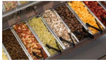
Whole Foods and Xerces Society Work to Help Pollinators at Risk