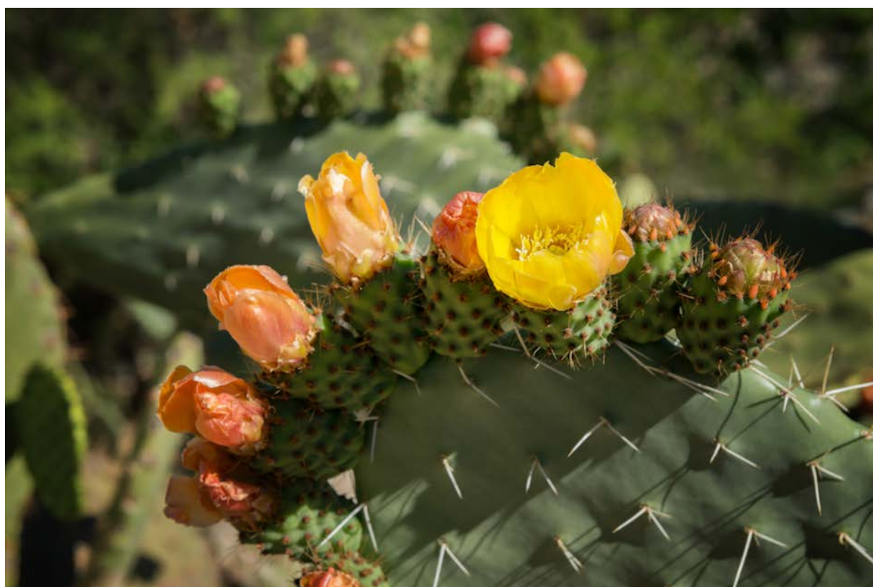
Prickly Pear Cactus ( Opuntia spp.)