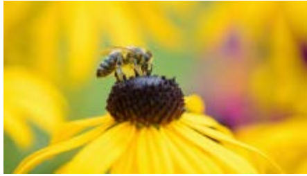
The Best Plants to Attract Pollinators, by Region