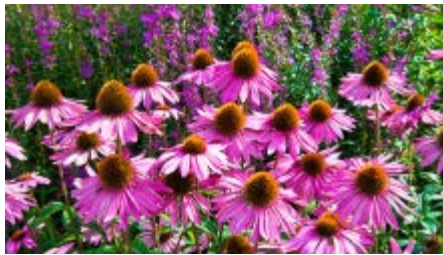
The Healing Garden: How to Grow 7 Medicinal Herbs at Home