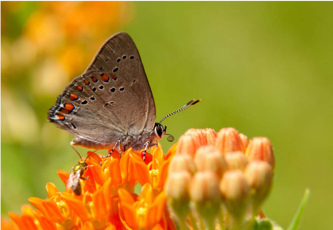
Tiny Coral Hairstreak Butterfly feeding on Milkweed ( Asclepias tuberosa ) by Sari ONeal on Shutterstock.