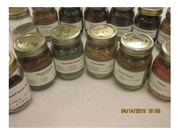
Figure 2. Large Cover Crop Seed Display

In Seed Display Two, 36 pint jars (2 cups seed) are used to display cover crop seed. The advantages are that drilled and broadcast seeding rates plus seeding depths can be added to each jar on a large label. The disadvantage is that fewer seeds may be displayed. The jars may break when dropped, so transporting glass jars is more hazardous. Mason jars may be purchased and carried in the original cardboard box. The estimated cost is $60 for three dozen mason jars and labels plus seed cost (Figure 2).