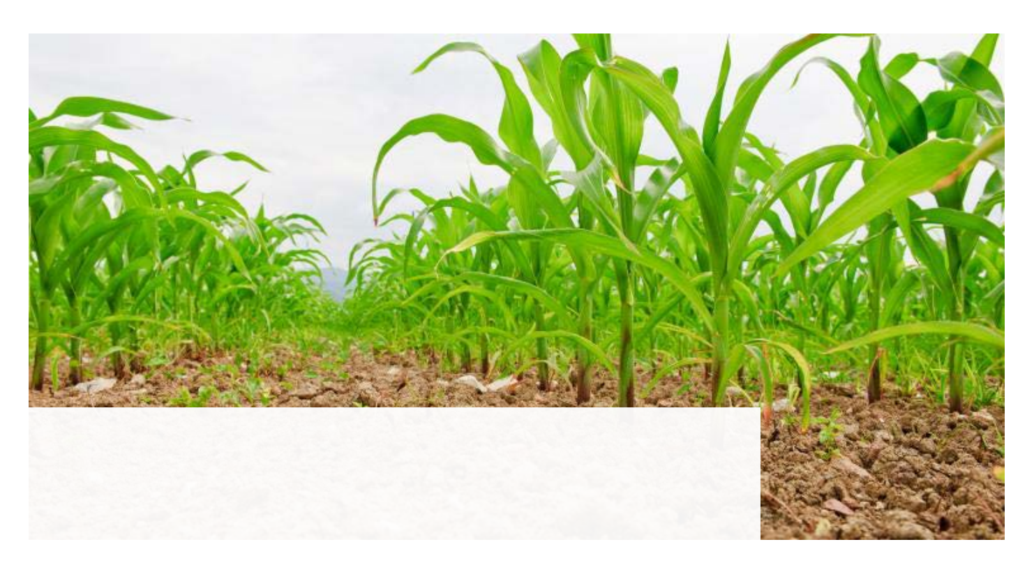
Rural job growth will be discussed at the Spring 2019 Outlook and Policy Conference.