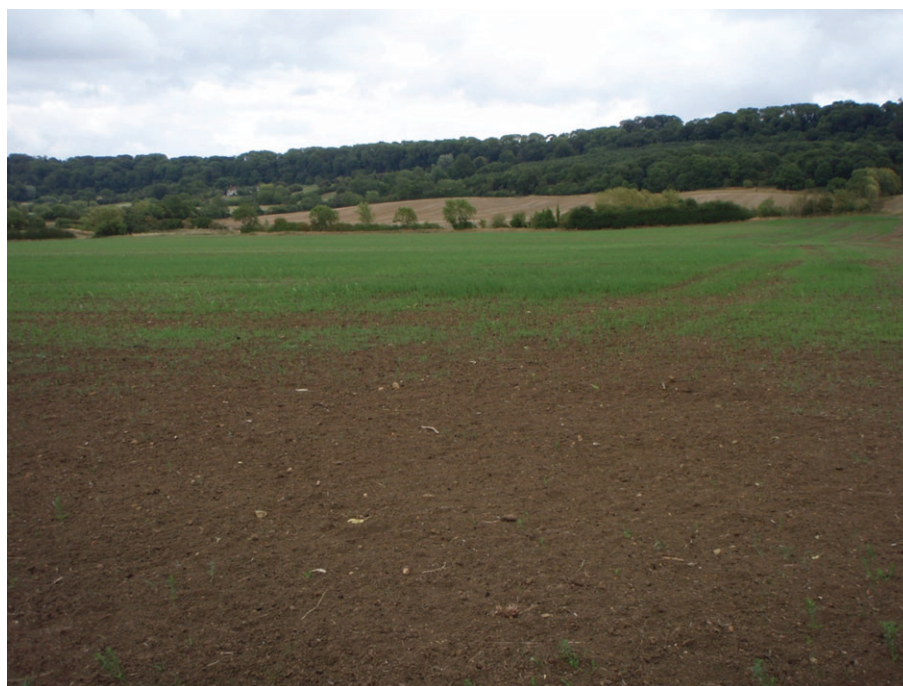
Figure 3. Cereal crop production, Warwickshire, UK. Soils are often seen as simply 'growing media' for food crops; however, functioning of microbiological communities within soils not only influences the supply of essential plant nutrients but also has great implications for the global carbon cycle and climate system that determines whether environmental conditions are favourable for crop growth.

the C cycle does not operate independently; it is closely coupled with that of other essential elements for microbial metabolism. This linkage occurs either via the use of the other elements as electron donors and acceptors (e.g. N species ranging from the most reduced, \text{NH}_4^+ , to the most oxidised, \text{NO}_3^- ) in energy transduction or via their immobilisation and mineralisation as part of multiple essential element-containing biomolecules (e.g. proteins, DNA). Hence the availability of other key elements essential for life, particularly N and P, and other environmental factors such as pH, soil texture and mineralogy, temperature and soil water content control the rate at which microbes consume and respire carbon. 11 It is these interactions between environmental conditions and biological processes, including primary production, that are chief in controlling the unequal distribution of organic matter across the world's soils. 12 The largest global concentration of carbon can be found in wet and cool areas in the northern hemisphere, dominated by deep accumulations of peat and permafrost soils, 13 whereas soils with the lowest carbon content tend to be those of desert biomes, 14 where low mean annual precipitation limits primary production and encourages the prevalence of aerobic soil conditions.